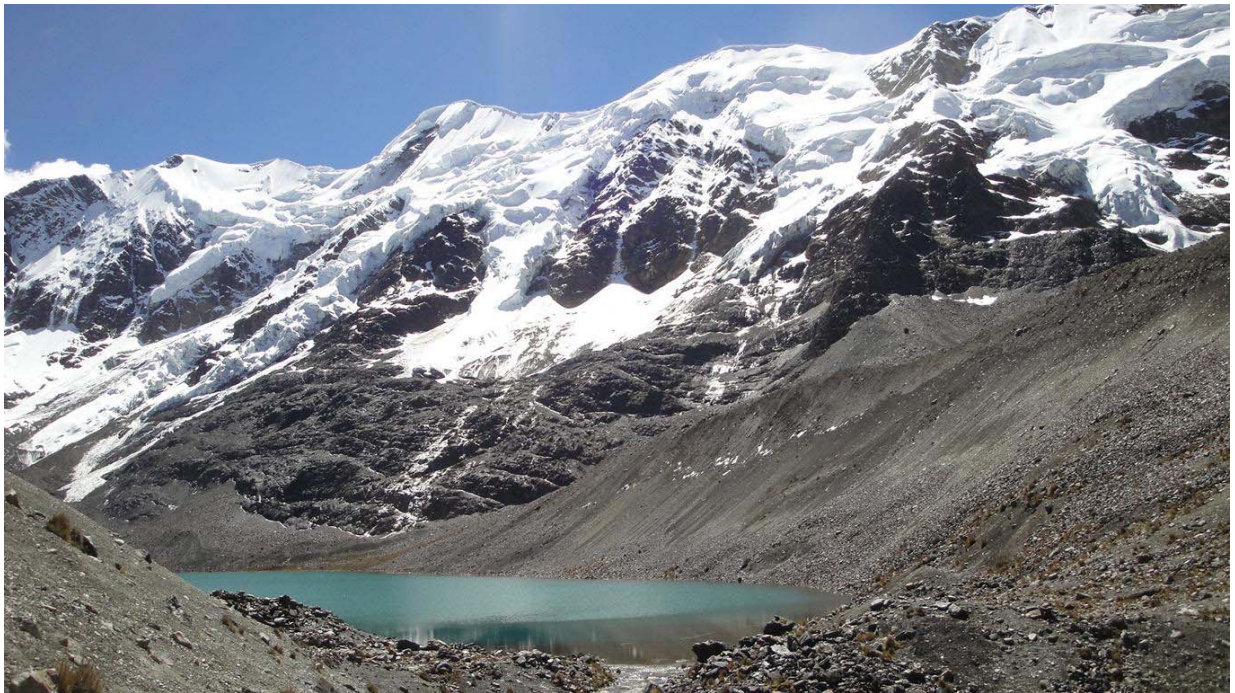
Figure 2: Moraine dammed Laguna Isquillani in Apolobamba´s Ulla Khaya region.

We, however, are only concerned with those glacial lakes of recent formation, which date from the last 30 years, are higher up in the mountains and much smaller than those mentioned before.