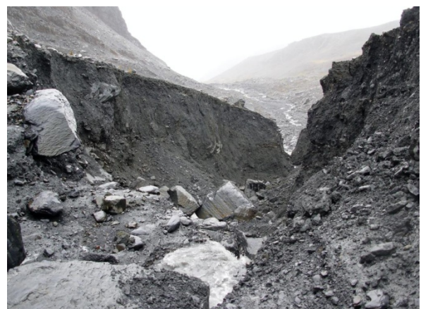
Figure 5: Breach in the moraine dam below the glacial lake

(Source: Martín Apaza Ticona, 4th November 2009)