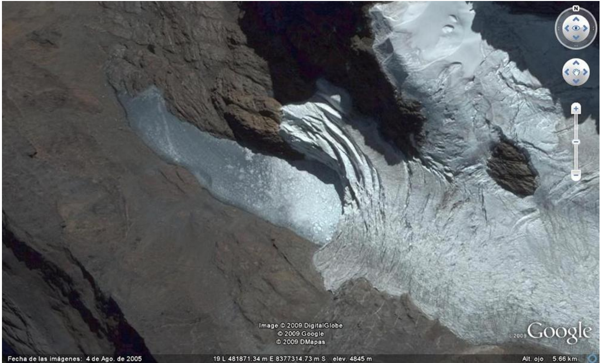
Figure 3: Satellite image of the ice dammed glacial lake above Keara

The small community of Keara on the Eastern Andean slopes at an altitude of around 3,800 meters, which belongs to the municipio of Pelechuco, was left without road communication for several months.