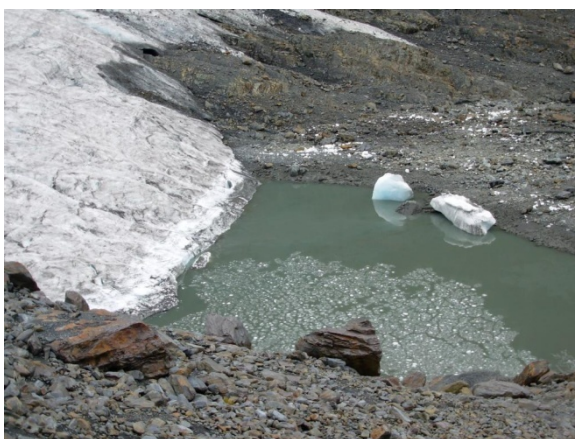
Figure 4: The glacial lake after the outbreak

Satellite images obtained from google.earth clearly show the glacier that holds up the lake. There was no technical enquiry and it has not been established, what exactly had happened. Still, this is up to now the only documented case of a glacier lake outburst flood, thanks to the field technician Martín Apaza, who, accompanied by locals, went up to the lake the day after the outbreak, took photographs and filed a first-hand report (Apaza Ticona, 2009)