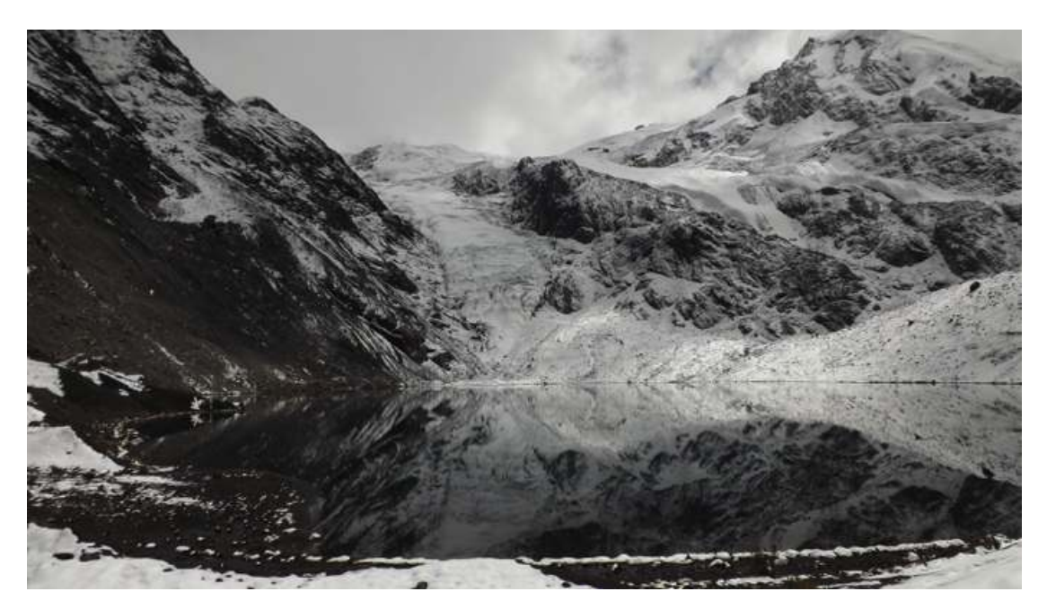
Figure 3 Lake PEL_ORCO_002

The aim of this project is to build on the regional hazard assessment made by Weggenmann by investigating in more detail the hazard potential of one particular lake, PEL_ORCO_002 (Figure 3). This lake was chosen for further investigation primarily because of the potential impact on human populations. The lake feeds a stream which runs through the Pelechuco valley. Two villages are located in this valley: Agua Blanca and Pelechuco. There is also an important access road running through the valley, at some points adjacent to the river.