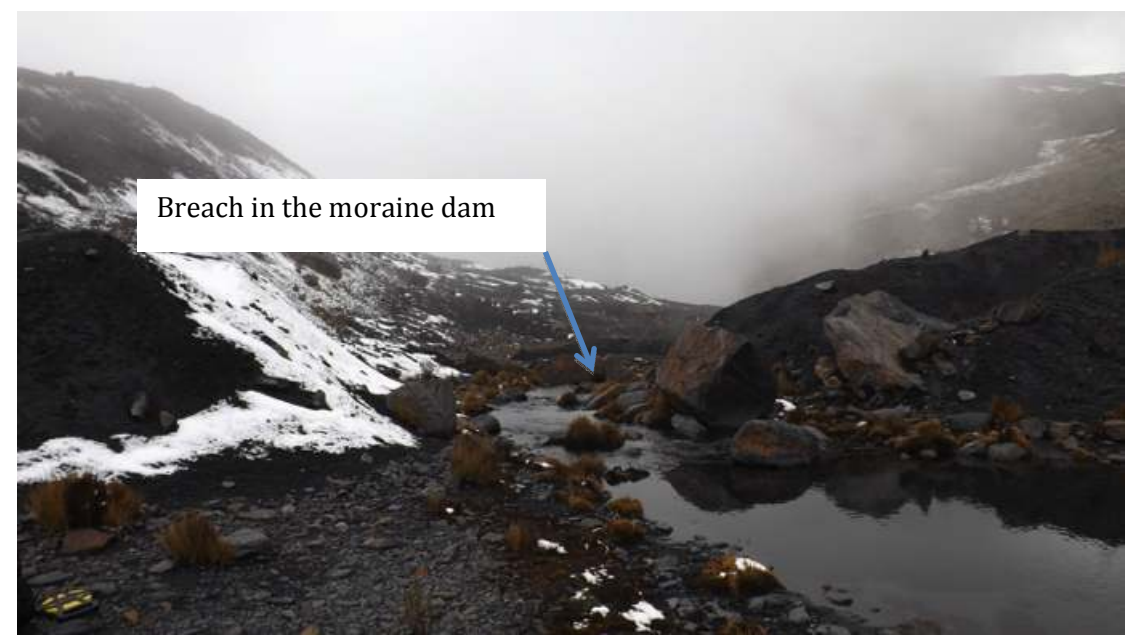
Figure 8 Breach in the moraine dam

There is already a breach in the moraine dam, suggesting than a small outburst flood may have occurred in the past. Because there is already a stream draining the lake, a sudden total lake drainage event is probably unlikely. However, a large volume of water might still exist the lake in the case of failure of the moraine dams on either side of the breach, which may occur as a result of a displacement wave (as outlined above) or as a result of the melting of ice cores inside the moraine dam. Further geophysical investigations would be needed to ascertain whether ice cores are present in the moraine dam.