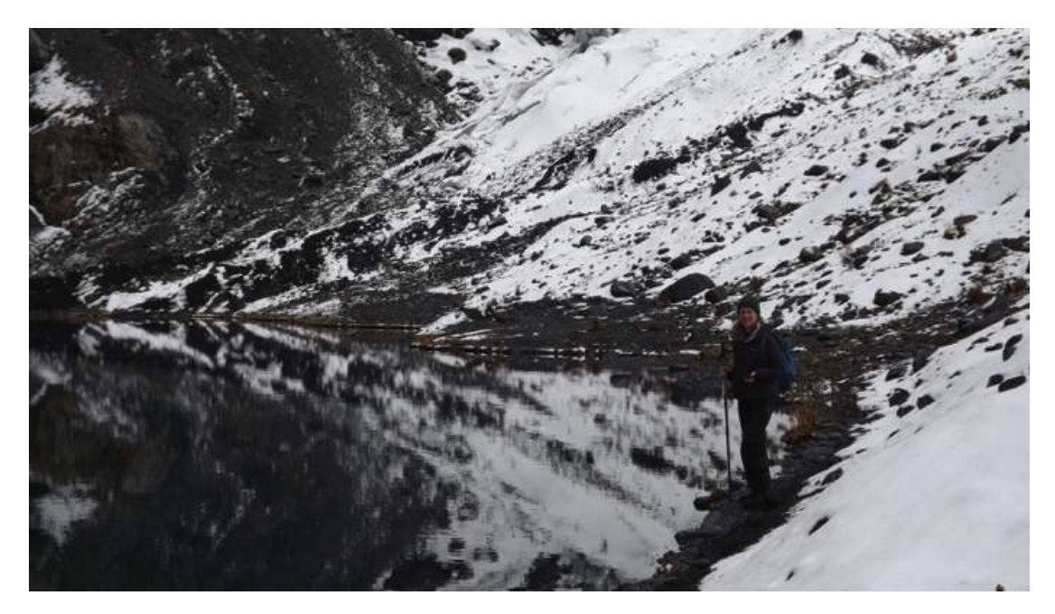
Figure 5 Measuring lake area

Valley and stream geometry data were obtained by measuring the cross-section of the river and valley at 14 locations. A 50m tape measure was placed across the stream and valley perpendicular to the flow, and depths to the ground were measured using a pole and tape measure (Figure 6).