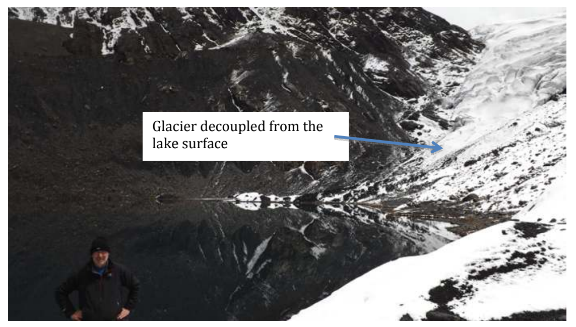
Figure 7 Glacier decoupled from lake surface

The glacier feeding the lake has decoupled from the water surface (Figure 7), which may reduce lake growth rates in the future and decrease the maximum potential flood volume. However, the retreating glacier still poses a risk for lake flooding since large blocks of ice may break off and fall into the lake, creating a displacement wave that may overtop and erode the moraine dam, causing it to fail.