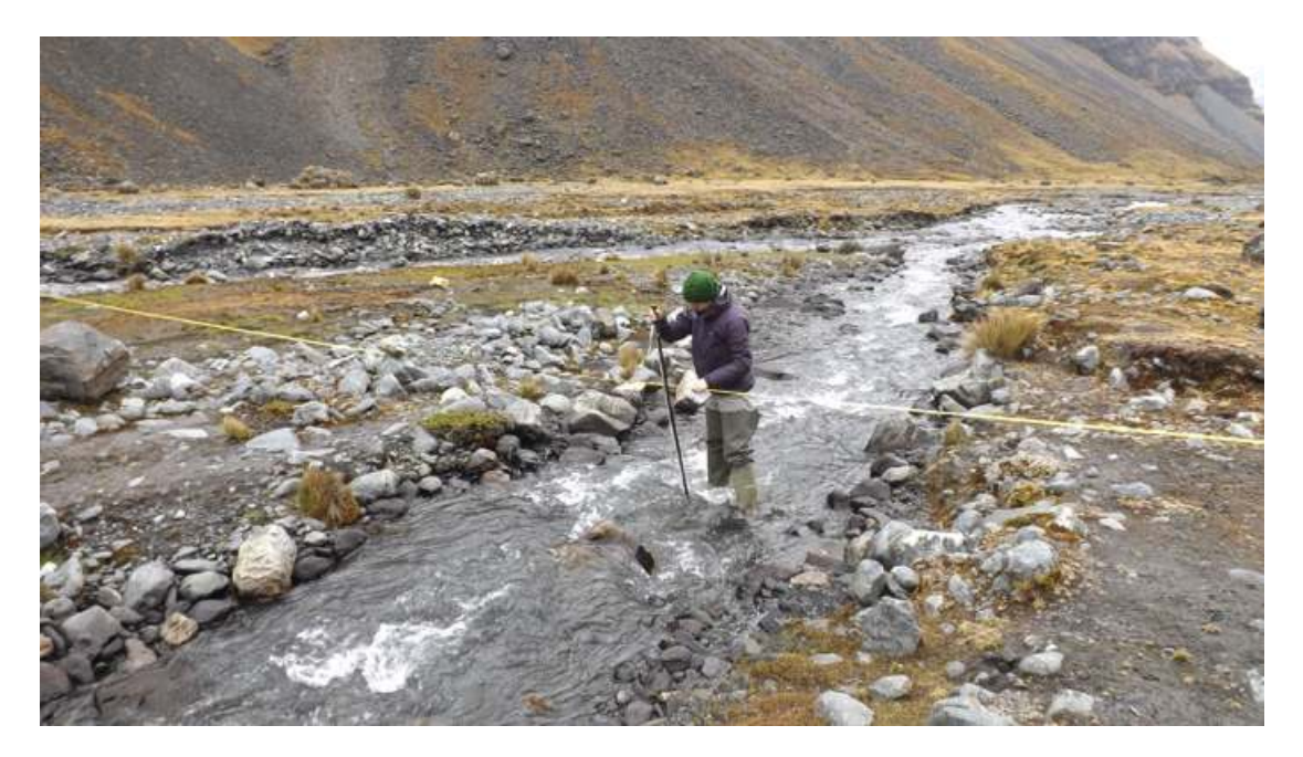
Figure 6 Measuring the stream and valley cross-section

Valley and stream geometry data were obtained by measuring the cross-section of the river and valley at 14 locations. A 50m tape measure was placed across the stream and valley perpendicular to the flow, and depths to the ground were measured using a pole and tape measure (Figure 6).