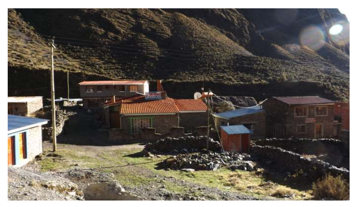
Figure 4 The tourist albergue in Agua Blanca

Therefore, fieldwork was undertaken to measure lake area and valley geometry at a higher resolution. To collect the data, six days were spent undertaking fieldwork in the Pelechuco valley. I stayed in the tourist albergue in Agua Blanca (Figure 4), with logistical assistance from Dirk Hoffman and RodriguoTarquino at the Bolivian Mountain Institute.