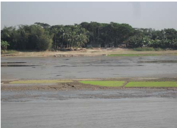
Floodplains in Bangladesh

Bangladesh is one of the most vulnerable countries to climate change in the world i . Bangladesh is geographically located between the Himalaya massive and the Bay of Bengal, and at the bottom of a river delta comprising the three major rivers of the region (Ganges, Meghna, Brahmaputra) and its 57 tributaries draining into the Indian Ocean. This means that all three major processes of climate change come together in this region: melting of the glaciers in the Himalaya, sea level rise in the Indian Ocean, storms and cyclones in the Bay of Bengal. 80% of the land is floodplains, between 1 meter above or below sea level. This leaves a major part of the country prone to flooding. With an estimated 1000 people per square kilometre, Bangladesh is one of the most densely populated states in the world. It is also one of the poorest: almost half the population lives in poverty, according to the World Bank-Index of 1.25 USD (PPP) per person a day.