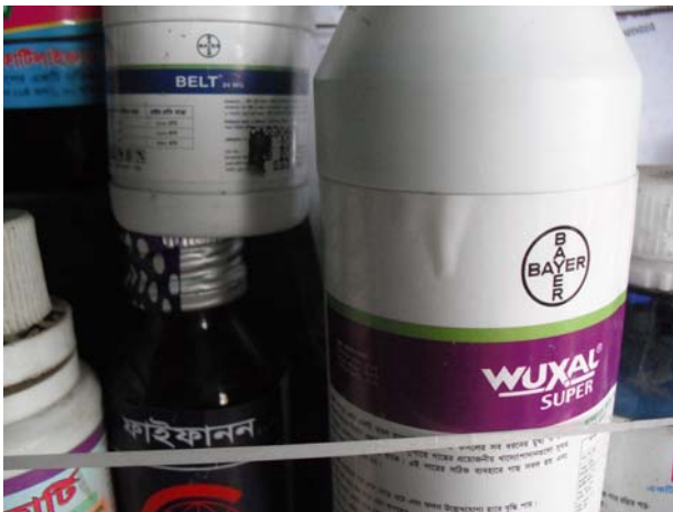
Pesticides for the agricultural market (left);

The government calls this strategy “food security”. By this, it means optimizing the farming output by industrializing the agriculture sector, primarily the use of high-yielding varieties and genetically modified organisms. In order to make these artificial seeds grow, the input of chemical additives, like fertilizers and pesticides, is needed. The interest of the government is to export farming products and to gain foreign currency. This strategy is backed by multilateral funds provided from the World Bank and international donors, which offer grants to introduce these seeds and chemicals in the farming sector. Their interest behind this strategy is to enable the multinational seed and chemical companies to access the agricultural market in Bangladesh.