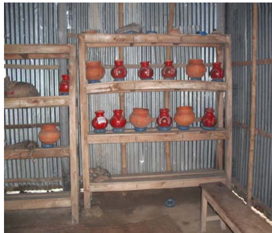
Seed bank of local traditional seeds for exchange among peasants (right)

Millions of peasants share the same negative experience of this concept of “food security”. The seeds are expensive and have to be bought every year, because the sterile seeds can’t be used again in the next sowing period. Fertilizers and pesticides are expensive, too, and destroy the fertility of the soil. After a maximum of two years of higher output, the crop yield is declining constantly, and has to be balanced by more chemical input, which means that farmers need to take up more loans. In the context of climate change, this is a risky strategy for farming, because when the peasants suffer losses after a natural disaster, they can’t pay back their loans. The debt urges them to sell their land and migrate to the urban areas or to work as landless laborers on the fields of big farmers.