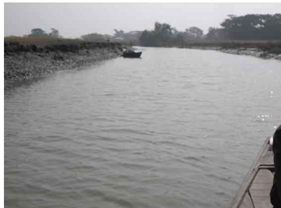
River erosion along the coastal area

Climate Change is already a painful reality in Bangladesh: farmers and peasants are facing losses of their harvest every year due to floods and heavy rainfalls; the seasons are changing with negative impacts on sowing and harvesting patterns; millions of people are losing their fields and homes due to cyclones, floods and river erosion. The population of Bangladesh has been used to storms and floods in the past, but now they are facing the impacts of increasingly frequent natural disasters. Therefore, the first part of this article will highlight some of these impacts already visible today and how they are forecasted for the near future. Although Bangladesh is known as one of the main manufacturers for the world's demand in textile and clothes, it is predominantly an agricultural country. Two thirds of the population is engaged in small-scale farming and other agricultural activities to generate income or for their subsistence. The second part of this article will shed light on the impacts on the agricultural sector and possible responses by peasants and small scale farmers.