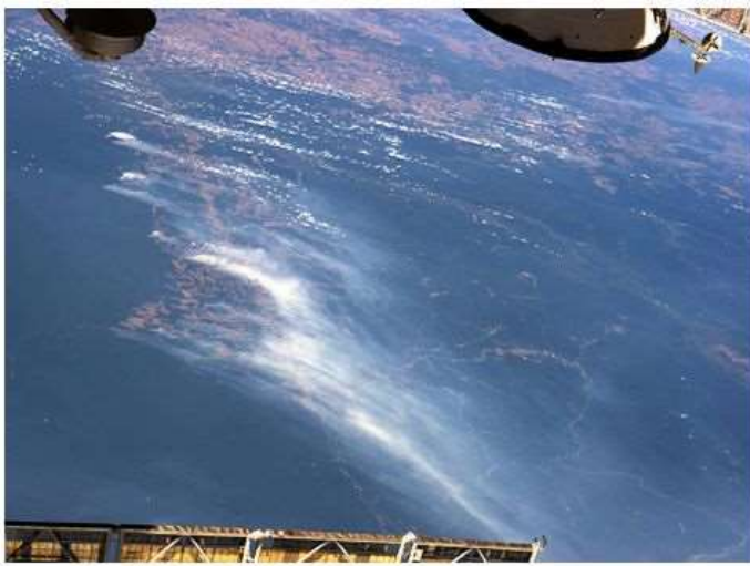
Caption: The smoke from multiple fires in the Mato Grosso region of Brazil rises over forested and deforested areas in this astronaut photograph taken from the International Space Station on Aug. 19, 2014.

Periodic droughts in the Amazon are nothing new, but large forest fires in the rainforest were unheard of until fairly recently. These fires are directly linked to widespread settlement and human-induced changes to the landscape. Undisturbed pristine rainforests are naturally fire resistant because the continuous forest canopy blocks sunlight and keeps the forest below cool and moist.